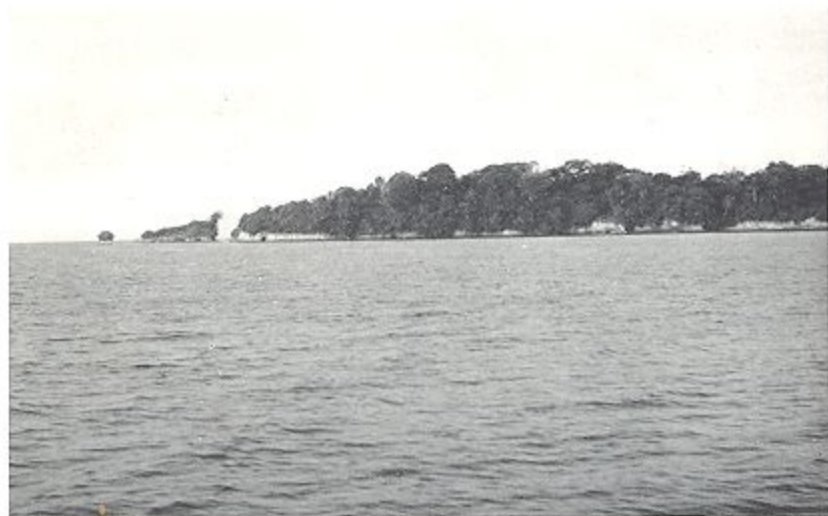
1. Western end of Isla Escudo de Veraguas, from the south.