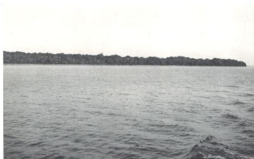
2. Southern shore of eastern end of Isla Escudo de Veraguas.