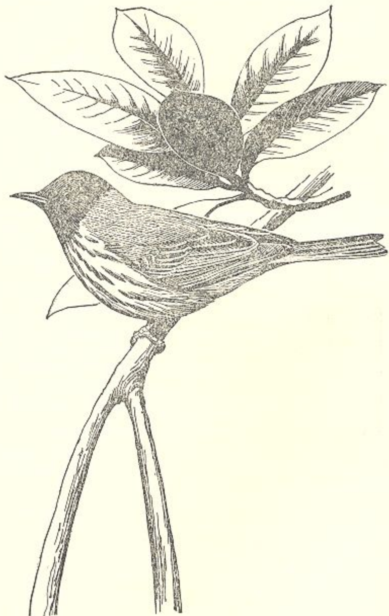
FIG. 3.—Golden warbler, Canario Manglero.